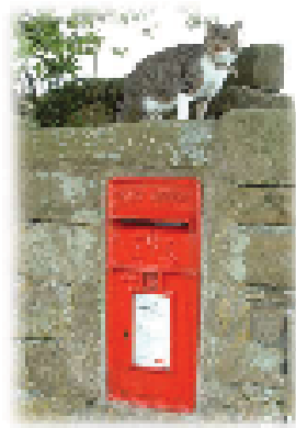
Postbox in Oakworth, West Yorkshire

City of Bradford Metropolitan District Council Countryside & Rights of Way