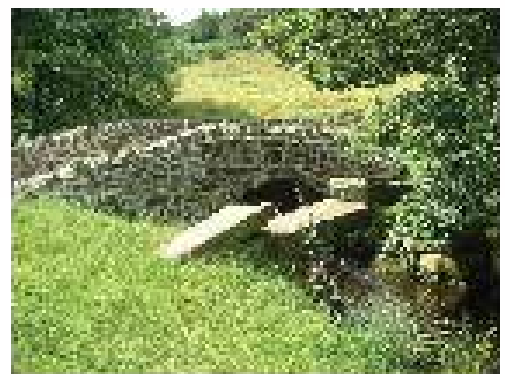
Old stone wall in the village of Newsholme Dene