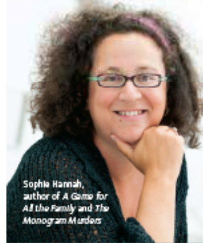
Sophie Hannah, author of A Game for All the Family and The Monogram Murders